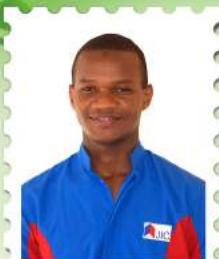
PRODUCTION Sulaiti Ddamulira