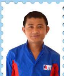
PRODUCTION Suk Lal Muktan