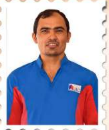
PRODUCTION Resham Cheetri