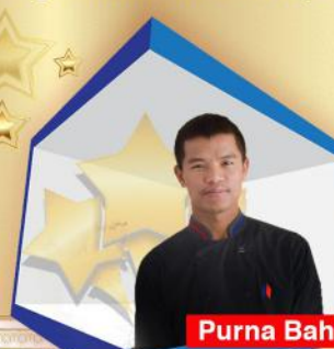
Purna Bahadur Production