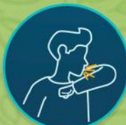
Cough on your elbow