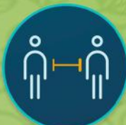
Keep your distance