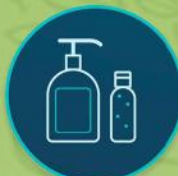
Use soap & Sanitizer