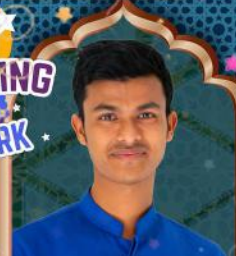
Azajul Dhali Dining Cleaner