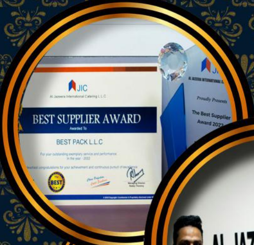
BEST SUPPLIER 2022