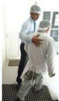
Staff being provided morale support