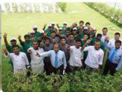
The enthusiasm among the JICites after their SKEA Awareness Training