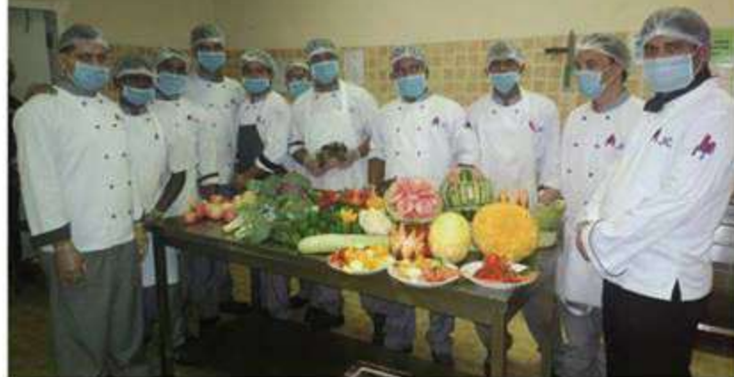
Knowledge sharing workshop conducted at our Sites - Fruit & Vegetable Carving Skills

Young Girl Praying: Please God marry me with an Intelligent Man.