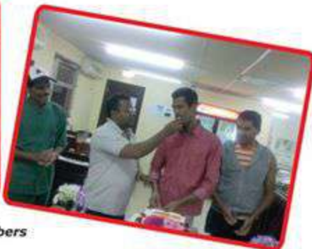
JIC ites Celebrating Birthdays of Team members at different sites