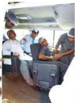
Staff being transported to the nearest Clinic / Hospital