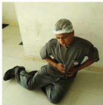
Staff Complaining of Stomach pain