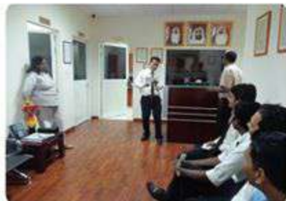
Singing Competition held among the Office staff