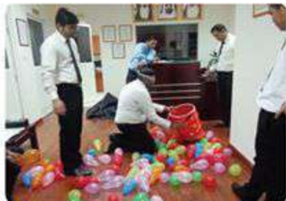
Blind Choice – collect the maximum single colour ballons in a minute.