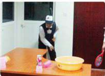
Breaking the Plastic Ghost Castle with a Table tennis Ball