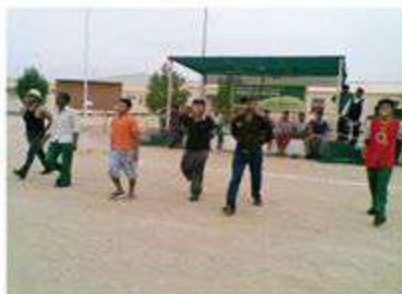
Lemon n Spoon