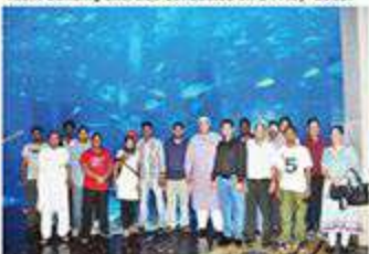
The management and office staff along with their families took time off from their daily routine and had a day of relaxation and fun in Dubai. All members were treated to a sumptuous lunch at Atlantis The Palm.