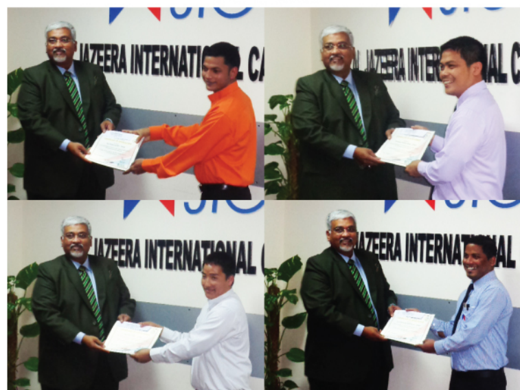
During the Environment Day Celebrations the JIC Staff displayed their passion for - Arts & Crafts. The winners were rewarded for their efforts.