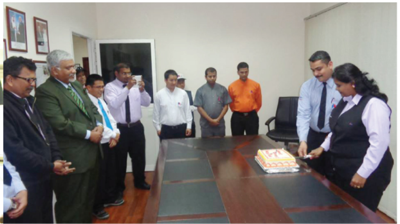
Of JIC Staff, For JIC Staff and By JIC Staff