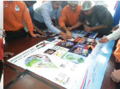
"Save Water Save Life" JIC conducted World Water Day on 22nd March 2014 as a means to focus attention on the importance of freshwater through word of mouth at the water stations and Water Day Puzzle – Learn as you Play.