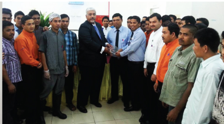
Best HSE Award for 2013 being presented to the Dining Team from one of our site