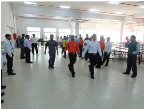
"Lemon & Spoon"