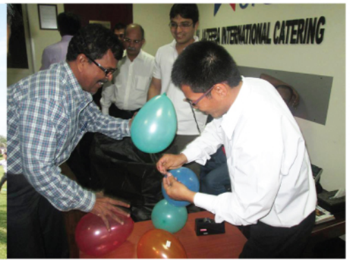
The Office staff enjoy Twister Event - displaying their skills at the various child games competition such as joining the straws, dodge ball and fixing the balloon