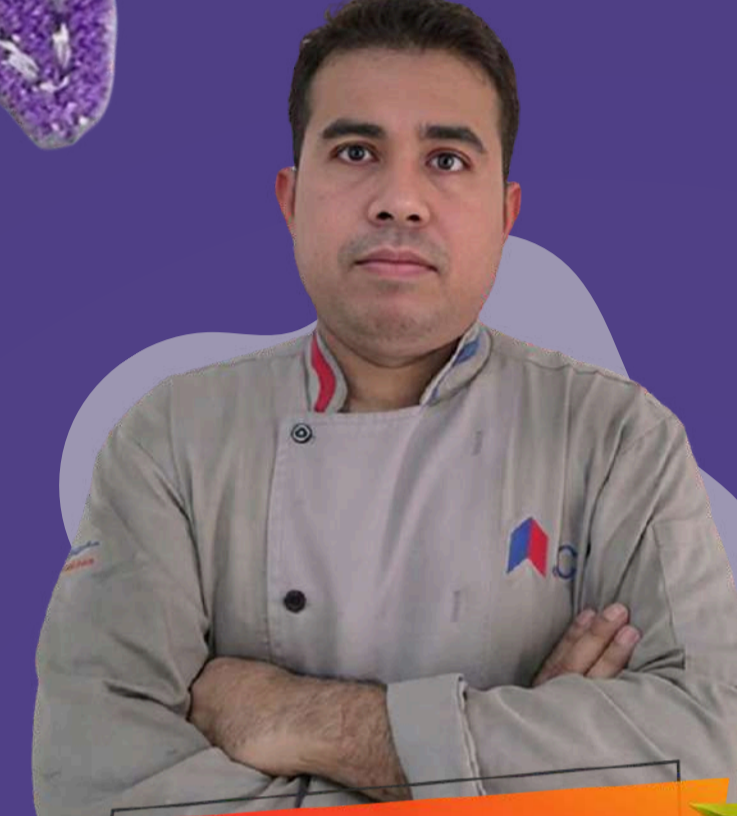
JULMOT HOSSIEN PRODUCTION