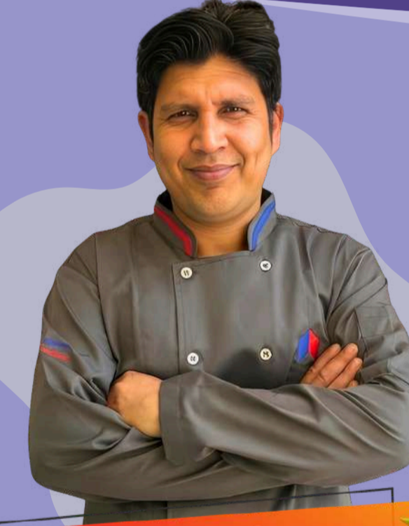
PARVEZ ALI PRODUCTION