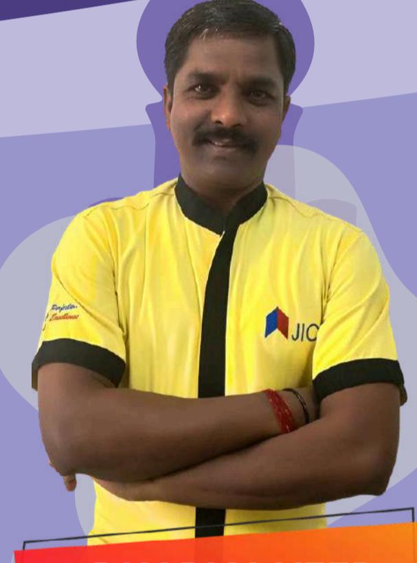
DHARMA VEER LAUNDRY