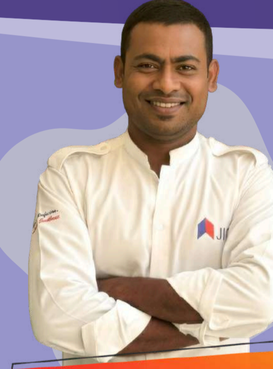
MD SHAKHAWAT LOGISTICS