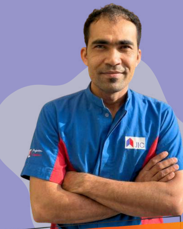
PRATAP NEPALI PRODUCTION