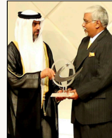
14th Cycle Sheikh Khalifa Excellence Award