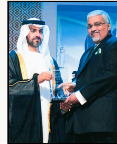
15th Cycle Sheikh Khalifa Excellence Award