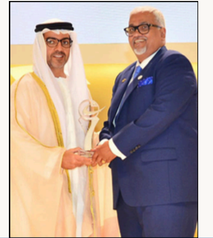
17th Cycle Sheikh Khalifa Excellence Award